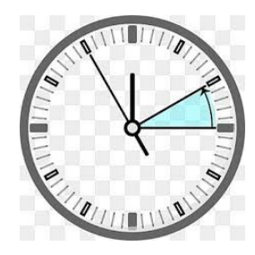
DAYLIGHT SAVING ENDS ON SUNDAY 7th April 2024

The Annual collection for the support of the Church in the Holy Land will take place on Good Friday, 29th March. This collection promotes the missionary work of the Church in the Holy Land by providing welfare assistance to local Christians in areas such as health, education, employment, housing, parishes, and orphanages. It is also used to maintain over 70 churches and shrines associated with the life of Jesus.