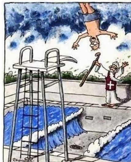
Moses' first and last day as a lifeguard.